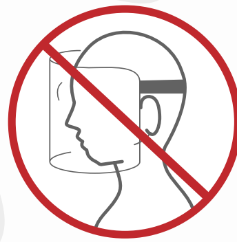
FACE SHIELD ONLY