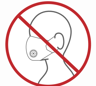
MASK WITH EXHALATION VALVE