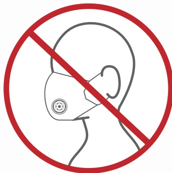
MASK WITH EXHALATION VALVE