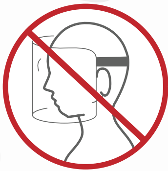
FACE SHIELD ONLY